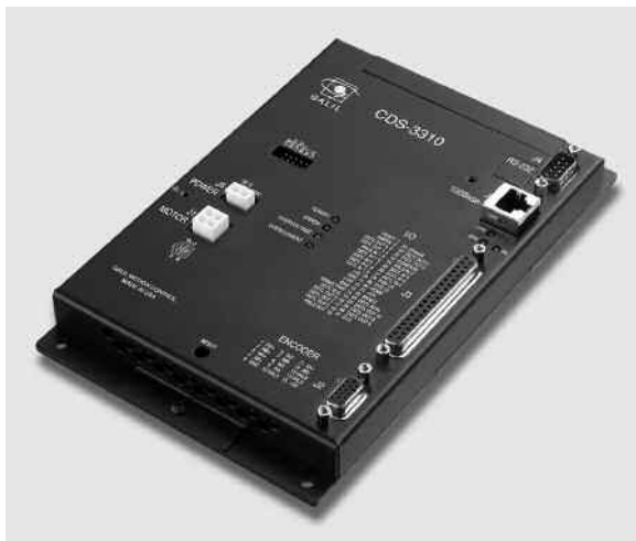
CDS-3310 Single-axis Controller and Drive System

The CDS-3310 incorporates a 32-bit microcomputer and provides such advanced features as PID compensation with velocity and acceleration feedforward, program memory with multitasking for simultaneously running up to eight programs, and uncommitted I/O for synchronizing motion with external events. Modes of motion include point-to-point positioning, jogging, contouring, and electronic gearing.