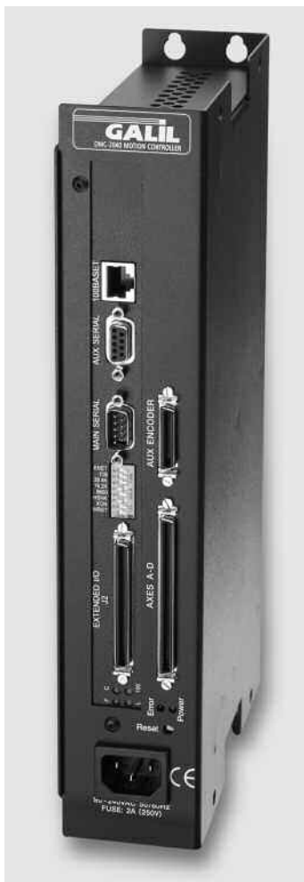
DMC-22x0 Stand-alone with Ethernet/RS232