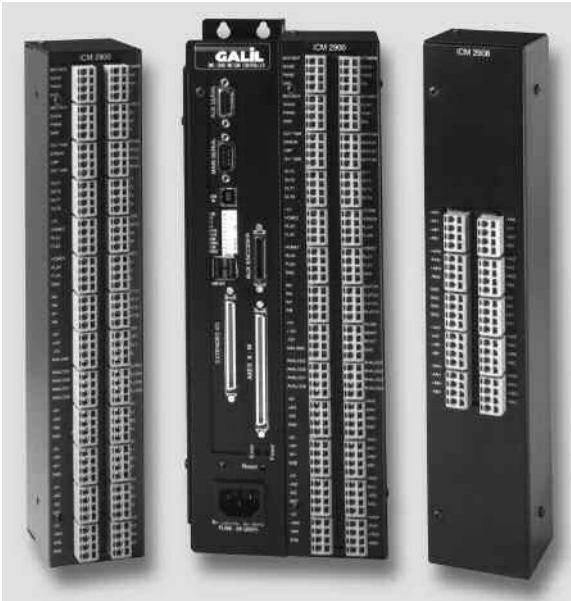
Left: ICM-2900 Interconnect Module Center: DMC-2040 with attached ICM-2900 Right: ICM-2908