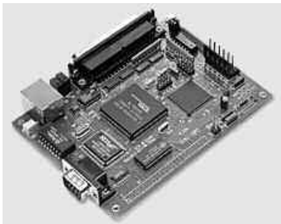
DMC-14x5 and DMC-34x5 Controllers

Like all Galil controllers, the DMC-14x5 and -34x5 controllers use a simple, English-like command language which makes them very easy to program. Galil's WSDK servo design software further simplifies system set-up with "one-button" servo tuning and real-time display of position and velocity information. Communication drivers are available for Windows, .NET, QNX, and Linux.