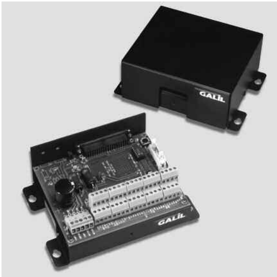
ICM-1460 Interconnect Module (shown with and without cover)

For applications requiring optoisolation, the ICM-1460 "OPTO" option provides 5–24 V optoisolation on all general inputs and outputs, home inputs, limits, and abort input.