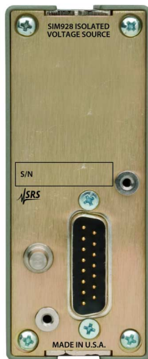
SIM928 rear panel