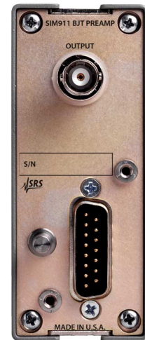
SIM911 rear panel