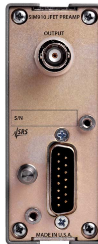
SIM910 rear panel