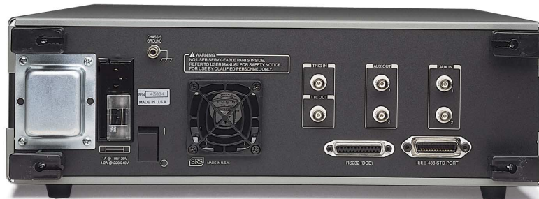
SR844 rear panel